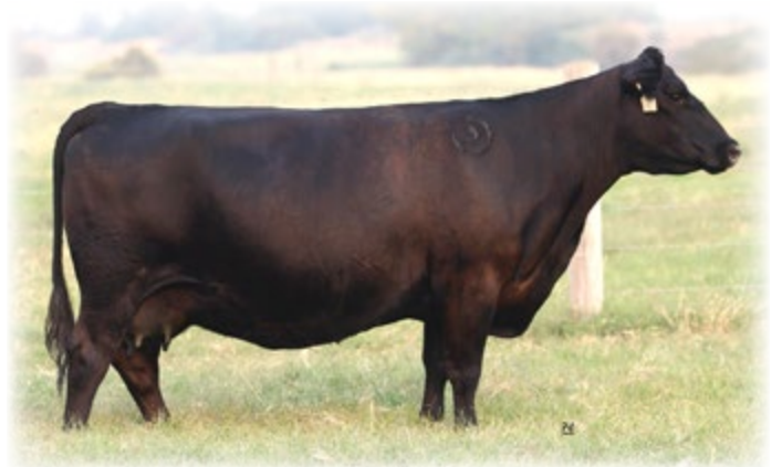
CCC Blackbirdmere 938 // Granddam of Lot 119